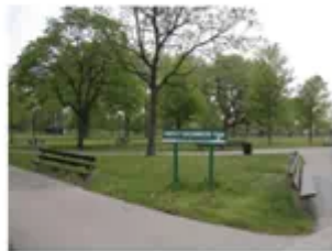
Image Natural Ecosystem and Artificial Ecosystem